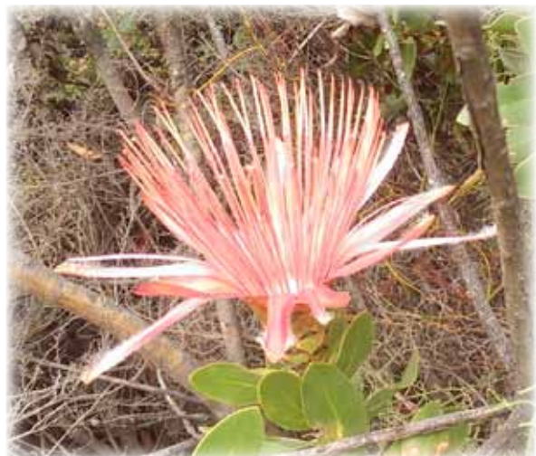
A pretty Protoceae species growing in the Otenequa