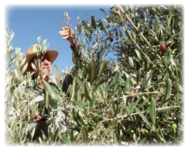
Farmer Buck harvesting the olive crop.