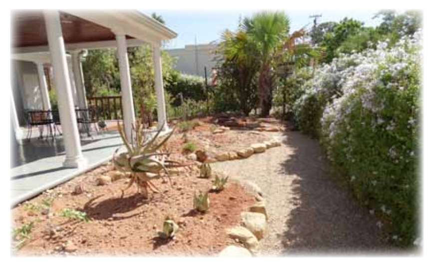
The garden is taking shape, and the plumbago looks spectacular this time of year.