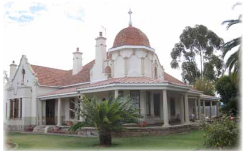
Buck and I had lunch with friends Neil and Brenda Currie at this 'Feather Palace' just outside Calitzdorp. Reichtfontein was built in 1909, the same vintage as our house. I had the most delectable ostrich fillet washed down with a wonderful local sauvignon blanc.