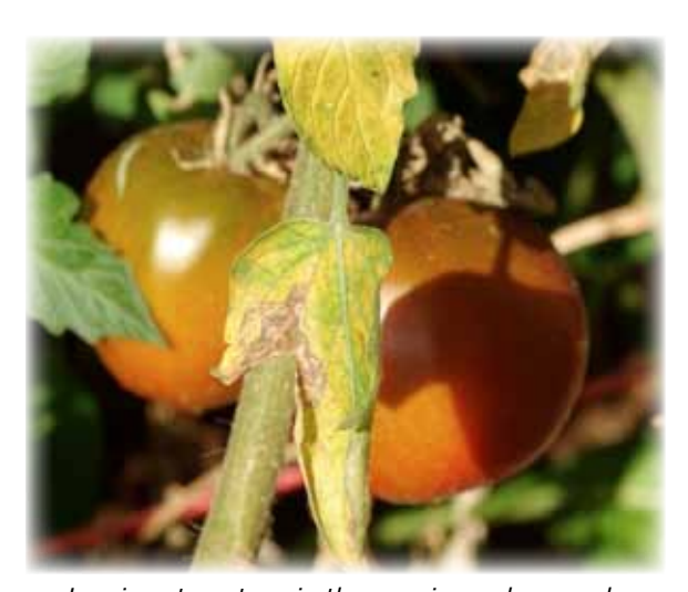
Luscious tomatoes in the veggie garden, ready for picking.