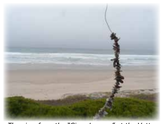
The view from the "Cigar Lounge" at the Vette Mossel. 5000 miles south to Antarctica.